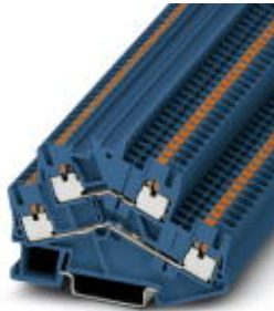
Double-level terminal block, Cross section: 0.14 mm 2 - 4 mm 2 , AWG: 26 - 12, Connection type: Push-in connection, Width: 5.2 mm, Color: blue, Mounting type: NS 35/7,5, NS 35/15

Please be informed that the data shown in this PDF Document is generated from our Online Catalog. Please find the complete data in the user's documentation. Our General Terms of Use for Downloads are valid ( http://download.phoenixcontact.com )