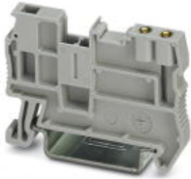
Screw flange, for screwing COMBI plugs, with the same structure and pitch as the relevant COMBI terminal blocks

Please be informed that the data shown in this PDF Document is generated from our Online Catalog. Please find the complete data in the user's documentation. Our General Terms of Use for Downloads are valid ( http://download.phoenixcontact.com )