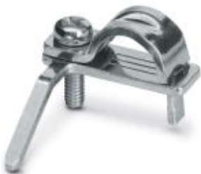
Shield connection clamp for printed circuit terminal block

Please be informed that the data shown in this PDF Document is generated from our Online Catalog. Please find the complete data in the user's documentation. Our General Terms of Use for Downloads are valid ( http://download.phoenixcontact.com )