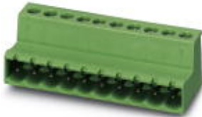
Plug component, Nominal current: 12 A, Rated voltage (III/2): 320 V, Number of positions: 3, Pitch: 5.08 mm, Connection method: Screw connection, Color: green, Contact surface: Tin

Please be informed that the data shown in this PDF Document is generated from our Online Catalog. Please find the complete data in the user's documentation. Our General Terms of Use for Downloads are valid ( http://download.phoenixcontact.com )