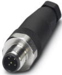
Sensor/actuator connector, male, straight, 5-pos., M12, screw connection, high-grade steel knurl, cable screw connection Pg7

Please be informed that the data shown in this PDF Document is generated from our Online Catalog. Please find the complete data in the user's documentation. Our General Terms of Use for Downloads are valid ( http://download.phoenixcontact.com )