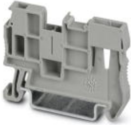
Self-locking flange, Width: 5.2 mm, Height: 35.3 mm, Color: gray, Mounting type: NS 35/7,5, NS 35/15

Please be informed that the data shown in this PDF Document is generated from our Online Catalog. Please find the complete data in the user's documentation. Our General Terms of Use for Downloads are valid ( http://download.phoenixcontact.com )