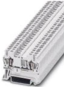
Feed-through terminal block, Connection method: Spring-cage connection, Cross section: 0.08 mm 2 - 4 mm 2 , AWG: 28 - 12, Width: 5.2 mm, Color: white, Mounting type: NS 35/7,5, NS 35/15

Please be informed that the data shown in this PDF Document is generated from our Online Catalog. Please find the complete data in the user's documentation. Our General Terms of Use for Downloads are valid ( http://download.phoenixcontact.com )