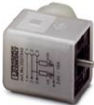
Valve connector, 5-pos., type A, for pressure switch, 2 LEDs, without protective circuit, screw connection, cable screw connection Pg9

Please be informed that the data shown in this PDF Document is generated from our Online Catalog. Please find the complete data in the user's documentation. Our General Terms of Use for Downloads are valid ( http://download.phoenixcontact.com )