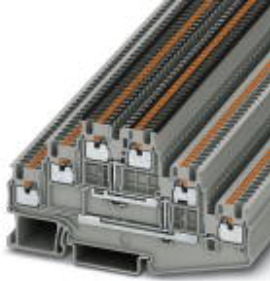
Multi-level terminal block, Cross section: 0.14 mm 2 - 1.5 mm 2 , AWG: 26 - 16, Connection type: Push-in connection, Width: 3.5 mm, Color: gray, Mounting type: NS 35/7,5, NS 35/15

Please be informed that the data shown in this PDF Document is generated from our Online Catalog. Please find the complete data in the user's documentation. Our General Terms of Use for Downloads are valid ( http://download.phoenixcontact.com )