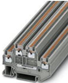
Double-level terminal block, Cross section: 0.14 mm 2 - 1.5 mm 2 , AWG: 26 - 14, Connection type: Push-in connection, Width: 3.5 mm, Color: gray, Mounting type: NS 35/7,5, NS 35/15

Please be informed that the data shown in this PDF Document is generated from our Online Catalog. Please find the complete data in the user's documentation. Our General Terms of Use for Downloads are valid ( http://download.phoenixcontact.com )