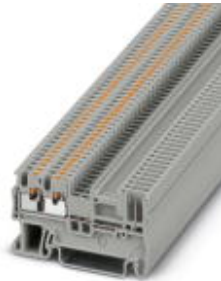
Feed-through terminal block, Connection method: Push-in / plug connection, Cross section: 0.14 mm 2 - 1.5 mm 2 , AWG: 26 - 14, Width: 3.5 mm, Color: gray, Mounting type: NS 35/7,5, NS 35/15

Please be informed that the data shown in this PDF Document is generated from our Online Catalog. Please find the complete data in the user's documentation. Our General Terms of Use for Downloads are valid ( http://download.phoenixcontact.com )