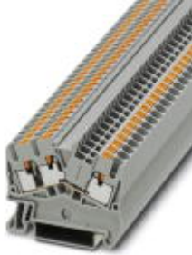
Feed-through terminal block, Connection method: Push-in connection, Cross section: 0.14 mm 2 - 4 mm 2 , AWG: 26 - 12, Width: 5.2 mm, Color: gray, Mounting type: NS 35/7,5, NS 35/15

Please be informed that the data shown in this PDF Document is generated from our Online Catalog. Please find the complete data in the user's documentation. Our General Terms of Use for Downloads are valid ( http://download.phoenixcontact.com )