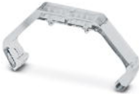
Single covers, color: transparent

Please be informed that the data shown in this PDF Document is generated from our Online Catalog. Please find the complete data in the user's documentation. Our General Terms of Use for Downloads are valid ( http://download.phoenixcontact.com )