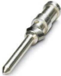
Turned 1.6 crimp contact, individual male contact, core diameter 0.14 to 0.37 mm 2 , silver-plated

Please be informed that the data shown in this PDF Document is generated from our Online Catalog. Please find the complete data in the user's documentation. Our General Terms of Use for Downloads are valid ( http://download.phoenixcontact.com )