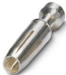
Turned 2.5 crimp contact, individual female contact, core diameter 0.75 to 1.00 mm 2 , silver-plated

Please be informed that the data shown in this PDF Document is generated from our Online Catalog. Please find the complete data in the user's documentation. Our General Terms of Use for Downloads are valid ( http://download.phoenixcontact.com )