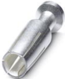
Turned 4.0 crimp contact, individual female contact, core diameter 6.00 mm 2 , silver-plated

Please be informed that the data shown in this PDF Document is generated from our Online Catalog. Please find the complete data in the user's documentation. Our General Terms of Use for Downloads are valid ( http://download.phoenixcontact.com )