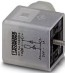
Valve connector, 3-pos., type A, 1 LED, with protective circuit, screw connection, cable screw connection Pg9

Please be informed that the data shown in this PDF Document is generated from our Online Catalog. Please find the complete data in the user's documentation. Our General Terms of Use for Downloads are valid ( http://download.phoenixcontact.com )