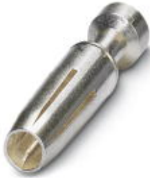
Turned 2.5 crimp contact, individual female contact, core diameter 4.00 mm 2 , silver-plated

Please be informed that the data shown in this PDF Document is generated from our Online Catalog. Please find the complete data in the user's documentation. Our General Terms of Use for Downloads are valid ( http://download.phoenixcontact.com )