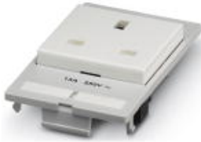
Ground contact socket, exclusively for service interface order no. 1656482 and 1656495, plastic, for Great Britain

Please be informed that the data shown in this PDF Document is generated from our Online Catalog. Please find the complete data in the user's documentation. Our General Terms of Use for Downloads are valid ( http://download.phoenixcontact.com )