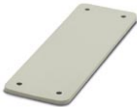
HEAVYCON cover plate, for wall cutouts of type B6, 3.5 mm thick, gray

Please be informed that the data shown in this PDF Document is generated from our Online Catalog. Please find the complete data in the user's documentation. Our General Terms of Use for Downloads are valid ( http://download.phoenixcontact.com )