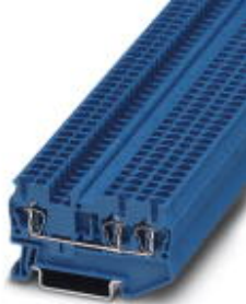
Feed-through terminal block, Connection method: Spring-cage connection, Cross section: 0.08 mm 2 - 4 mm 2 , AWG: 28 - 12, Width: 5.2 mm, Color: blue, Mounting type: NS 35/7,5, NS 35/15

Please be informed that the data shown in this PDF Document is generated from our Online Catalog. Please find the complete data in the user's documentation. Our General Terms of Use for Downloads are valid ( http://download.phoenixcontact.com )