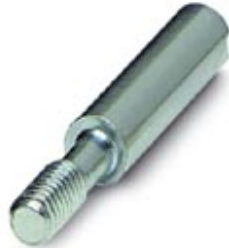
Coding peg for coding up to 16 connectors

Please be informed that the data shown in this PDF Document is generated from our Online Catalog. Please find the complete data in the user's documentation. Our General Terms of Use for Downloads are valid ( http://download.phoenixcontact.com )