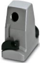
HEAVYCON ADVANCE EMV sleeve housing B6, with bayonet locking, height 100 mm, with 1xM25 thread, lateral cable outlet

Please be informed that the data shown in this PDF Document is generated from our Online Catalog. Please find the complete data in the user's documentation. Our General Terms of Use for Downloads are valid ( http://download.phoenixcontact.com )