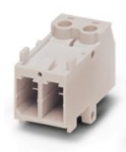
Contact insert module, for panel mounting frames, with screw connection, 2-pos., 400 V / 20 A

Please be informed that the data shown in this PDF Document is generated from our Online Catalog. Please find the complete data in the user's documentation. Our General Terms of Use for Downloads are valid ( http://download.phoenixcontact.com )