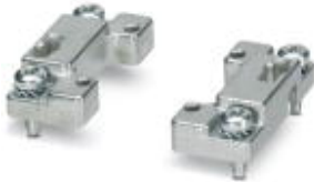
Bayonet mounting flange set, consisting of 2 mounting flanges with 4 self-tapping Torx® head screws and 4 fan-type spacers

Please be informed that the data shown in this PDF Document is generated from our Online Catalog. Please find the complete data in the user's documentation. Our General Terms of Use for Downloads are valid ( http://download.phoenixcontact.com )