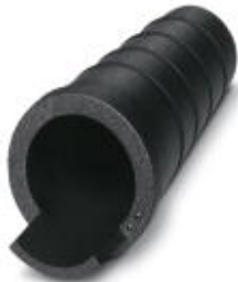
Bend protection sleeve, for cable diameter of 4 mm ... 12 mm, Color: black

Please be informed that the data shown in this PDF Document is generated from our Online Catalog. Please find the complete data in the user's documentation. Our General Terms of Use for Downloads are valid ( http://download.phoenixcontact.com )