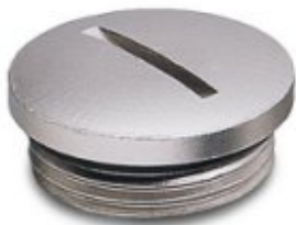
Filler plugs, for Pg screw connections, type Pg21

Please be informed that the data shown in this PDF Document is generated from our Online Catalog. Please find the complete data in the user's documentation. Our General Terms of Use for Downloads are valid ( http://download.phoenixcontact.com )