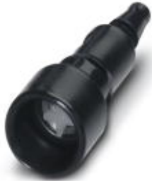
Pneumatics socket with valve, for HC-M-PN3 module, cross section of hose 3.0 mm

Please be informed that the data shown in this PDF Document is generated from our Online Catalog. Please find the complete data in the user's documentation. Our General Terms of Use for Downloads are valid ( http://download.phoenixcontact.com )