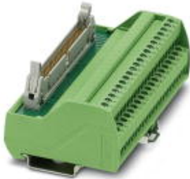
VARIOFACE interface module, for I/Os of the SIMATIC® S7-400, with SIMATIC®-specific marking, only in conjunction with FLKM 50-PA-S400

Please be informed that the data shown in this PDF Document is generated from our Online Catalog. Please find the complete data in the user's documentation. Our General Terms of Use for Downloads are valid ( http://download.phoenixcontact.com )