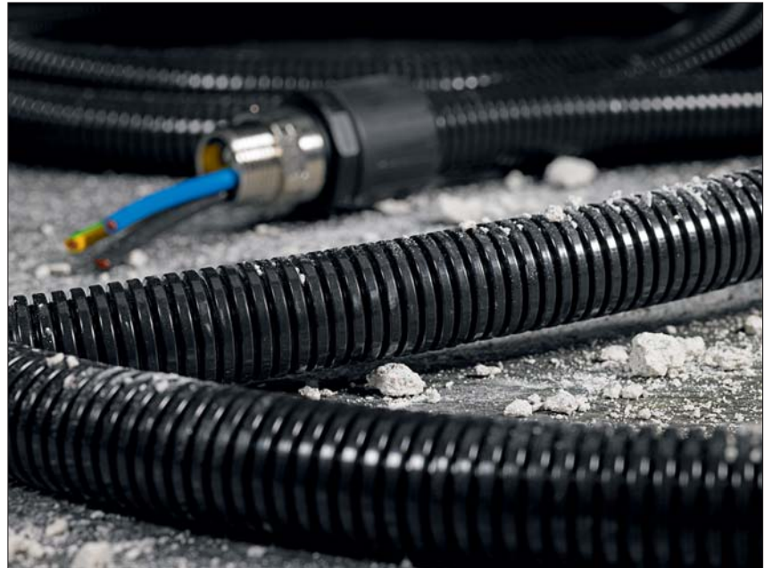
HelaGuard PA6 Standard for industrial applications.

Machine building, plant construction, control panels, public buildings.