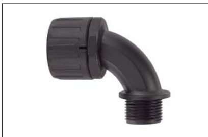
HelaGuard HG-90 90° Elbow, IP66.