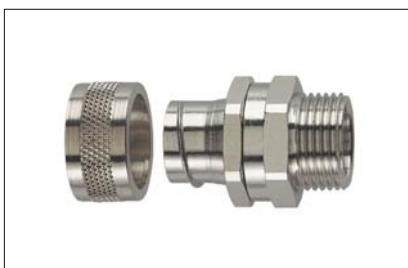
Helaguard PCS-SM Swivel External Thread.