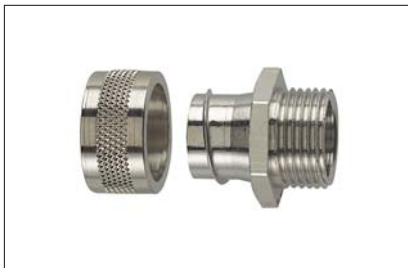
Helaguard PCS-FM Fixed External Thread.