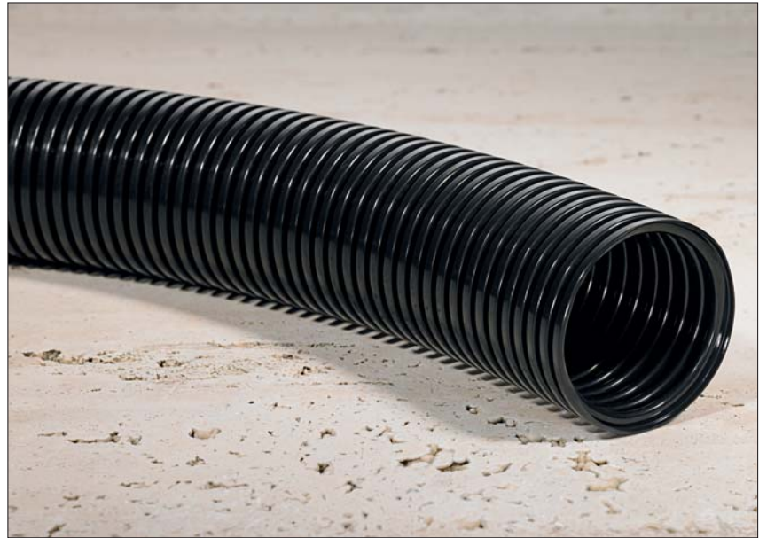
HelaGuard PA12 is ideal for robotics.

Robots, rail, machine building, plant construction and wherever continual movement and bending are requirements.