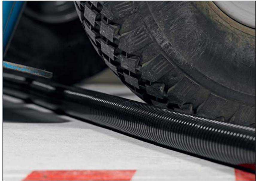
When high mechanical protection is needed: HelaGuard PA6 Heavy.

Heavy-duty machine building, plant construction, and public buildings, wherever high mechanical strength is required.