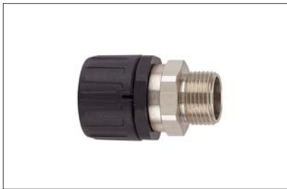
HelaGuard HG-SM Straight Swivel External Thread, IP66.