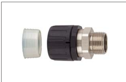
HelaGuard HGL-SM Straight Swivel External Thread with conduit seal, IP68.