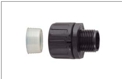
HelaGuard HGL-S Straight with conduit seal, IP68.