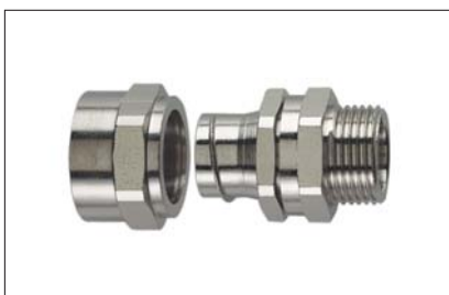
HelaGuard PCSB-SM Swivel External Thread.