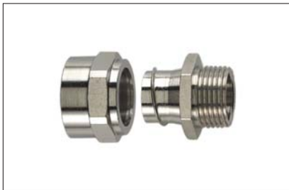
HelaGuard PCSB-FM Fixed External Thread.