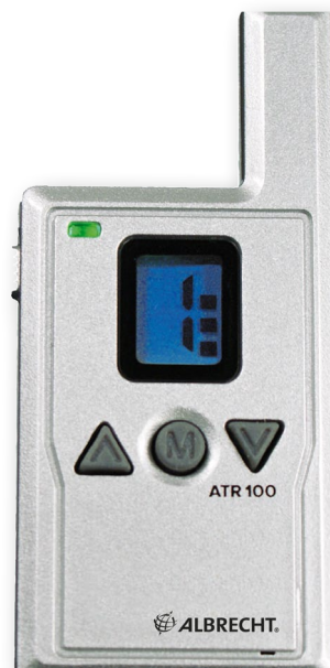
Receiver for the tourist ATR 100