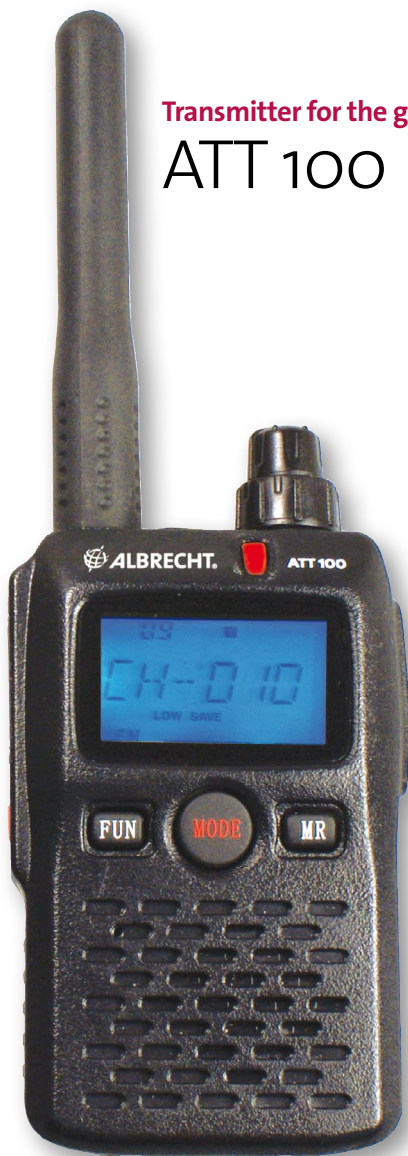
Transmitter for the guide ATT 100

The modular tourist guide system that leaves nothing to be desired.