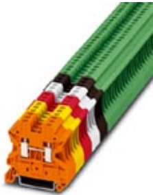
Feed-through terminal block, Connection method: Screw connection, Cross section: 0.14 mm 2 - 4 mm 2 , AWG: 26 - 12, Width: 5.2 mm, Color: black, Mounting type: NS 35/7,5, NS 35/15

Please be informed that the data shown in this PDF Document is generated from our Online Catalog. Please find the complete data in the user's documentation. Our General Terms of Use for Downloads are valid ( http://download.phoenixcontact.com )