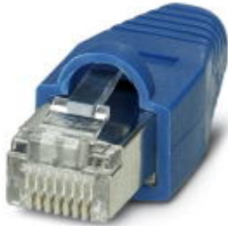
RJ45 plug, CAT5e, 8-pos., shielded, IDC connection technology, for litz wire and solid 26...24 AWG wire, with blue bend protection sleeve

Please be informed that the data shown in this PDF Document is generated from our Online Catalog. Please find the complete data in the user's documentation. Our General Terms of Use for Downloads are valid ( http://download.phoenixcontact.com )