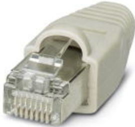
RJ45 plug, CAT5e, 8-pos., shielded, IDC connection technology, for litz wire and solid 26...24 AWG wire, with gray bend protection sleeve

Please be informed that the data shown in this PDF Document is generated from our Online Catalog. Please find the complete data in the user's documentation. Our General Terms of Use for Downloads are valid ( http://download.phoenixcontact.com )