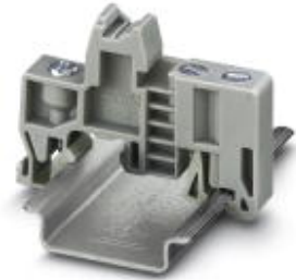
End clamp, for assembly on NS 32 or NS 35/7.5 DIN rail

Please be informed that the data shown in this PDF Document is generated from our Online Catalog. Please find the complete data in the user's documentation. Our General Terms of Use for Downloads are valid ( http://download.phoenixcontact.com )