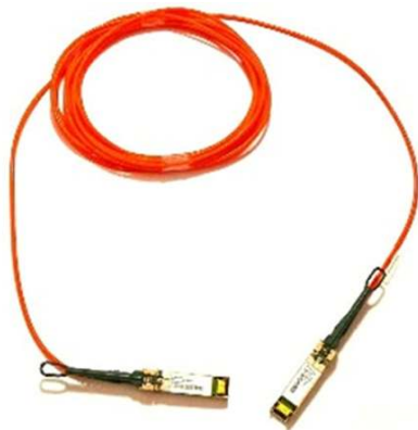
Figure 3. Cisco Direct-Attach Active Optical Cables with SFP+ Connectors

Cisco SFP+ Active Optical Cables (Figure 3) are direct-attach fiber assemblies with SFP+ connectors. They are suitable for very short distances and offer a cost-effective way to connect within racks and across adjacent racks. Cisco offers Active Optical Cables in lengths of 1, 2, 3, 5, 7, and 10 meters.