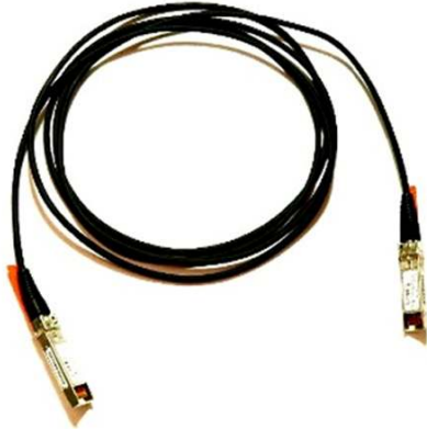
Figure 2. Cisco Direct-Attach Twinax Copper Cable Assembly with SFP+ Connectors