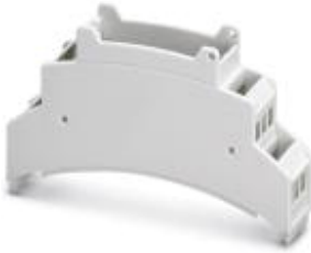
Upper part for installation housing BC, prepared for application of MKDSO connection method, width: 17.8 mm

Please be informed that the data shown in this PDF Document is generated from our Online Catalog. Please find the complete data in the user's documentation. Our General Terms of Use for Downloads are valid ( http://download.phoenixcontact.com )