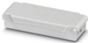
Cover for installation housing BC 17.8...

Please be informed that the data shown in this PDF Document is generated from our Online Catalog. Please find the complete data in the user's documentation. Our General Terms of Use for Downloads are valid ( http://download.phoenixcontact.com )