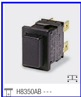
H8350AB --- T8350AB ---