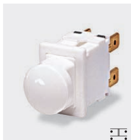
H8350DB --- T8350DB ---