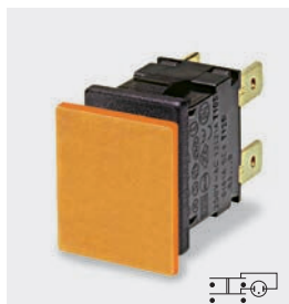
H8353CB --- T8353CB ---