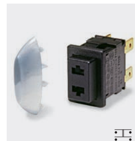
H8350HB --- Example of button