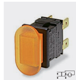
H8353EB --- T8353EB ---