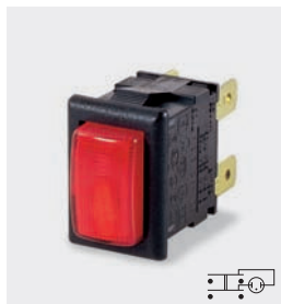
H8353JE --- T8353JE ---