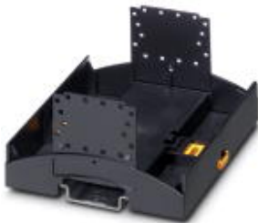
Lower part for installation housing BC 53.6...

Please be informed that the data shown in this PDF Document is generated from our Online Catalog. Please find the complete data in the user's documentation. Our General Terms of Use for Downloads are valid ( http://download.phoenixcontact.com )