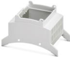
Upper part for installation housing BC, width: 53.6 mm, wiring space depth: 11 mm

Please be informed that the data shown in this PDF Document is generated from our Online Catalog. Please find the complete data in the user's documentation. Our General Terms of Use for Downloads are valid ( http://download.phoenixcontact.com )