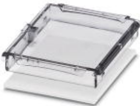
Transparent cover for installation housing BC 53.6...

Please be informed that the data shown in this PDF Document is generated from our Online Catalog. Please find the complete data in the user's documentation. Our General Terms of Use for Downloads are valid ( http://download.phoenixcontact.com )