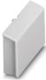
Keying tab 53.6 mm

Please be informed that the data shown in this PDF Document is generated from our Online Catalog. Please find the complete data in the user's documentation. Our General Terms of Use for Downloads are valid ( http://download.phoenixcontact.com )